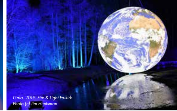
Gaia, 2019. Fire & Light Falkirk

Visit The Museum of Gloucester this summer and get a little closer to our nearest neighbour... The Moon Exhibition features all things moon and space-related, from a replica spacesuit to lunar command